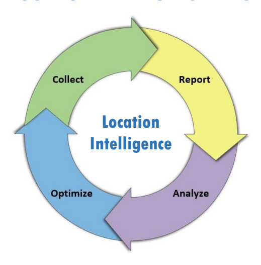
Figure 2. Location Intelligence Lifecycle

Location intelligence is a continuous improvement process of four main phases: collecting, reporting, analysis and optimization. (Figure 2.)